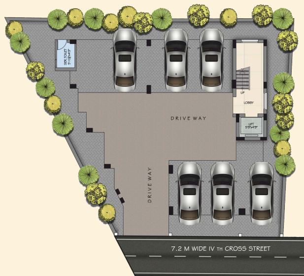
Stilt Floor Plan